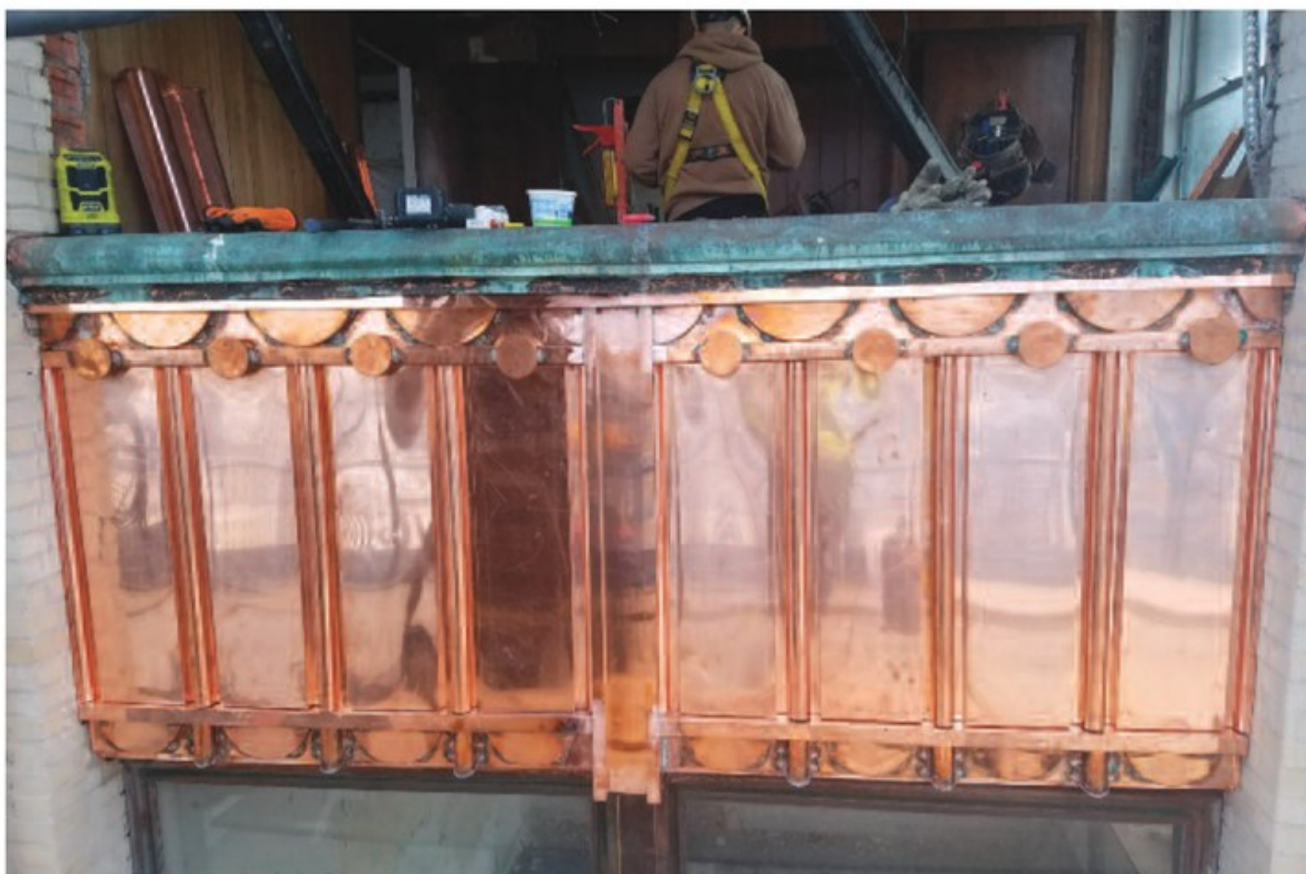
CASS Sheet Metal replaced, but mainly repaired, the ornate, copper spandrel panels located on three different floors of the Book Tower. Shown above, one of the newly replicated spandrel panels is aglow in new copper. Ultimately, CASS sprayed a patina accelerator on the newly fabricated copper to blend it with the seasoned, greenish-blue color of the existing spandrels.

resealing these equipment areas and repairing various details with asphalt mastic does not work with copper roofing,” said Parvin. “Repairs all around the existing building were done improperly