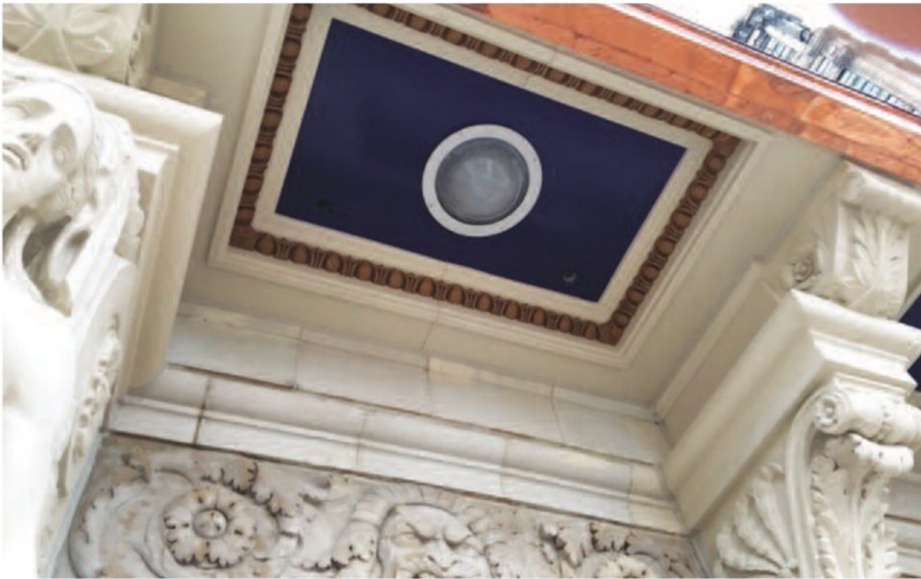
The entire east cornice of the Book Building was removed and replicated, including installing new support steel, replicating the original ornamentation in glass fiber reinforced polymer, and replacing the cornice's deteriorated copper sections with newly fabricated copper.