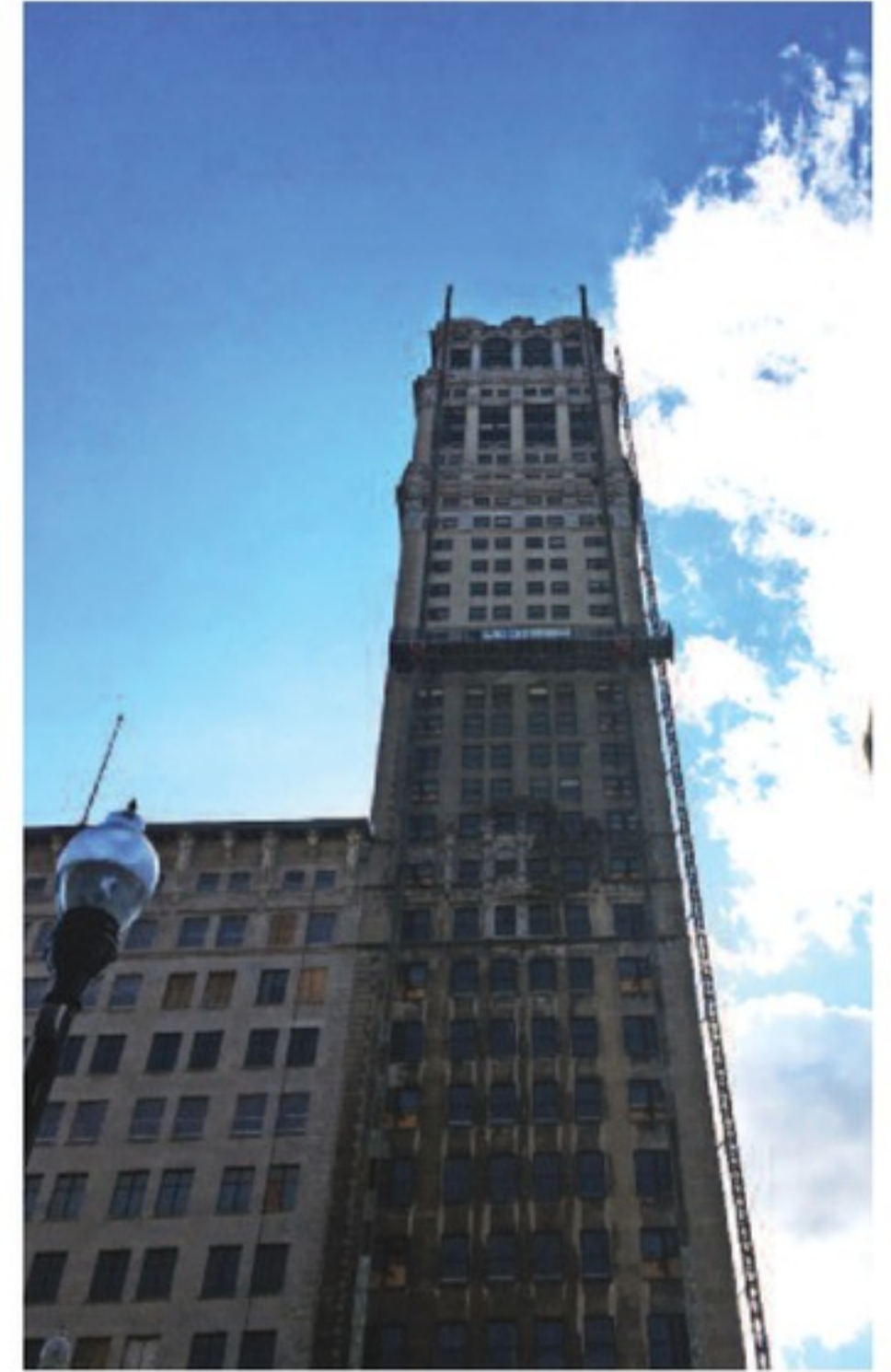
Left/Middle: Removed in 2016, the damaged terra-cotta sculptures had been architecturally supporting the cornice of the Book Building, circa 1917, for just under a hundred years. Each of the 13-foot-tall female sculptures, called caryatids, is now replicated in fiberglass.